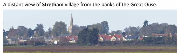
A distant view of Stretham village from the banks of the Great Ouse.

The history of the Round House in Little Thetford is open to debate – although sometimes dated to the late 15th century, the earliest documented mention is from 1793. It was reproduced in miniature as part of the popular Lilliput Lane range of collectibles.