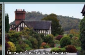
Beeston Castle in the distance