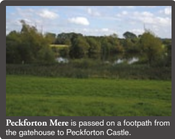
Peckforton Mere is passed on a footpath from the gatehouse to Peckforton Castle.