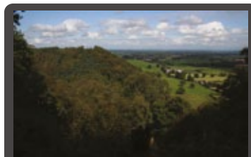
Bulkeley Hill provides superb views over the Peckforton Hills and Cheshire Plain.