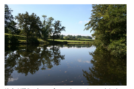
Little Mill Pond , one of several attractive ponds in the area that once supplied a head of water to local watermills.