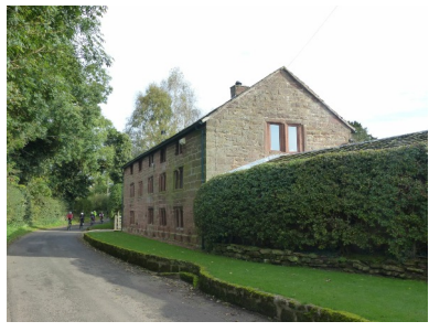
The Bailiff's House is a Grade II listed building, which possibly acted as the forest courthouse or as the home of an officer of Delamere Forest.