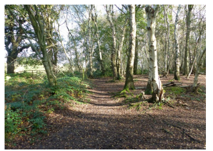
Little Budworth Common is an SSSI, described as "one of the best surviving examples of lowland heath in Cheshire".