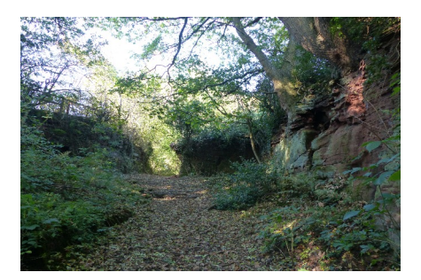
Lightfoot Lane is an old quarryman's path that runs through a disused stone quarry above the pretty village of Eaton on the slopes of Luddington Hill.