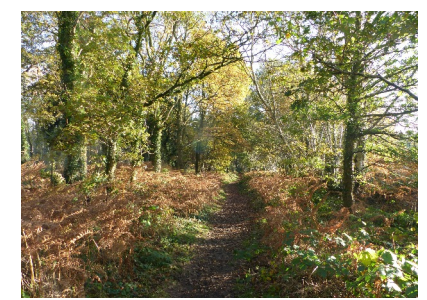
Little Budworth Common is a designated Site of Special Scientific Interest, with a mosaic of heathland and woodland habitats