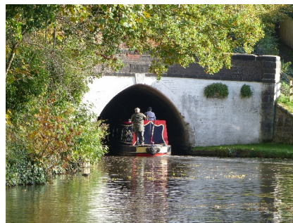
Salterford Tunnel on the Trent & Mersey Canal is 424 yards long. As one end cannot be seen from the other, a timed entry system operates.