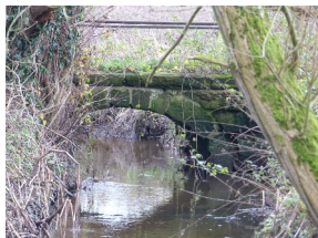
This packhorse bridge spans Acton Brook near Crowton.