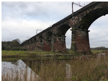
Dutton Viaduct is Grade II* listed and was completed in 1836. Railway pioneer George Stephenson was one of its designers.