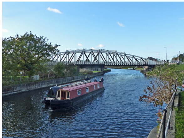
Acton Swing Bridge carries the A49 over the Weaver Navigation. Technically known as a bowspring truss bridge, it was constructed in the 1930s to a late Victorian design.