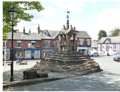
Lymm Cross (right) is a Grade I listed building. The cross itself dates from the mid-17th century and is surrounded by a square pavilion in red Cheshire sandstone with bronze sundials (added 1897) on three of its gables. The adjacent stocks are Grade II listed and share the cross's natural sandstone plinth.