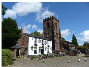
The Parr Arms stands in a fine position next to St Wilfrid's Church, Grappenhall . A carving on the church tower is said to have inspired Lewis Carroll's grinning Cheshire Cat in Alice's Adventures in Wonderland .