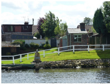
The Penny Ferry at Thelwall has been in operation since the Ship Canal opened in 1894 and is the last hand ferry on its entire length. It replaced a pontoon system that was used to ferry livestock as well as passengers. The quaint ferryman's shed and carefully maintained lawns are worth seeing even when the ferry is not operating.