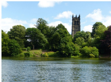
Lymm Dam was created in 1824 when a turnpike road was built between Warrington and Stockport. The area, previously part of the Lymm Hall Estate, is now a local beauty spot and much-loved amenity. Kingfishers and Cormorants are among the wildlife on view.

Walkers are always very welcome at The Crown at Lymm, but we ask that visitors with dogs or walking boots limit themselves to the garden and hard-floored areas. Large groups are advised to contact us in advance and those planning to dine may wish to book a table to avoid disappointment.