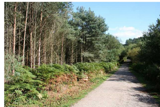
Delamere Forest , a 1000-hectare relic of the hunting forests of the Earls of Chester, is criss-crossed by walking and cycling trails.