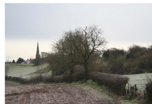
A wintry view across fields to the church at Ashton Hayes , built in 1849.