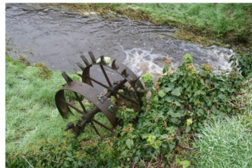
The scant remains of a waterwheel stand by the bridge over Ashton Brook at Swinford Mill Farm .