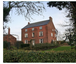
The current house at Manley Old Hall is Victorian. But behind the house stands a ruined gatehouse or porch, probably medieval in date and later converted into a dovecote.