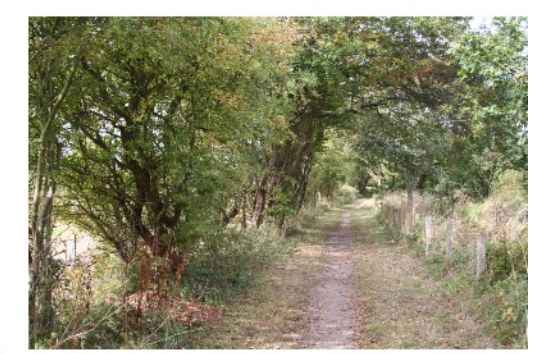
The Wirral Way follows the former branch line from Hooton to West Kirby, which closed in 1962.