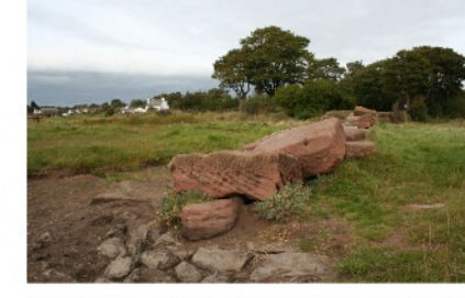
Denhall Old Quay was the site of a busy port in the 16th century, but the silting up of the Dee estuary saw it fall into disuse. It now provides a useful vantage point for observing the saltmarshes and their birdlife.

OPEN: Mon–Sat: 11am–11pm Sunday: 11am–10.30pm FOOD SERVED: Mon–Sat: 12 noon–9.30pm Sunday: 12 noon–9pm