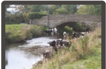
The Afon Alun or River Alyn flows from the Clwydian mountains through Loggerheads and Mold to its confluence with the Dee.