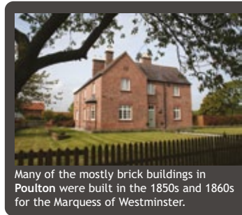
Many of the mostly brick buildings in Poulton were built in the 1850s and 1860s for the Marquess of Westminster.