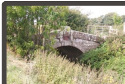
Pulford Brook is dredged to improve drainage in this low-lying area, and is followed by the border between England and Wales.