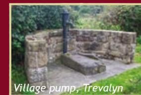
Village pump, Trevalyn

9. Follow the hedged track for ¾ mile, crossing the Old Pulford Brook as the landscape opens up until reach a stone bridge over the Pulford Brook drain by a metal-clad pumphouse. 10. Cross the field to a further footbridge, then follow the left-hand edge of the following field with a ditch and hedge on your left. 11. In the corner of the field go through a gate and continue in similar vein along the left-hand edge of the next field until you reach a gate into a hedged green lane. 12. At Meadow House follow the metalled lane beyond, which curves left and then passes through a flood embankment by Meadow Farm. 13. At a T-junction turn left, and then take a footpath on the right through a kissing gate that rises to cross the floodbank. Beyond the bank, head half-left across to the hedge on the far side of the field before following it left. When the hedge bends to the right, strike out to a gate in the far corner. 14. Beyond the gate, take a stile on the left; head diagonally right across the next field to the river, then turn right (upstream) and follow the stream to a further stile. 15. Keep along the river until you reach a stile and steps to a road. Cross straight over, descend the steps to a second stile and continue along the riverside path beyond.