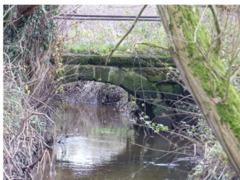
This stone bridge over Acton Brook near Crowton appears to qualify as a packhorse bridge but seems to have escaped the notice of Ernest Hinchliffe, the compiler of the definitive book on the subject.