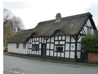
Poplar Cottage is one of a number of historic thatched and half-timbered cottages to feature in the Weaverham Heritage Scheme. The cottage is, like most of the others in the scheme, Grade II listed.