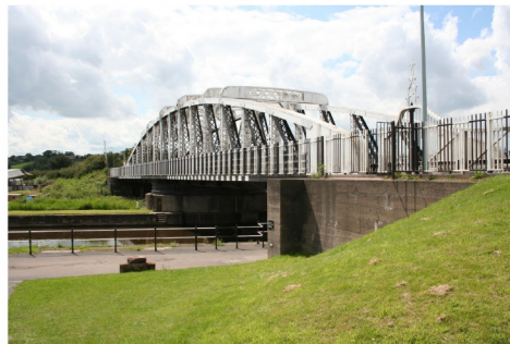
Acton Swing Bridge carries the A49 over the Weaver Navigation. Technically known as a bowstring truss bridge, it was constructed in the 1930s to a late Victorian design.