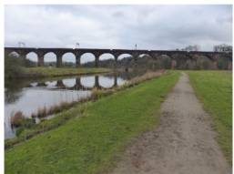
Dutton Viaduct is Grade II* listed and was completed in 1836. Railway pioneer George Stephenson was one of its architects.

Cormorants are frequently seen along the River Weaver. Formerly confined mainly to coasts, they are now fairly common inland, to the chagrin of coarse anglers.