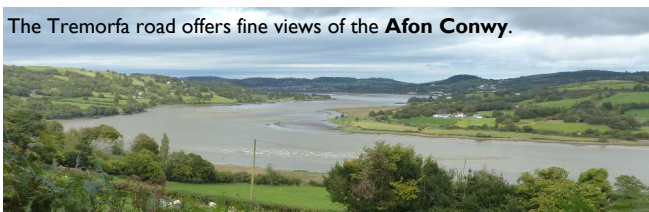
The Tremorfa road offers fine views of the Afon Conwy .