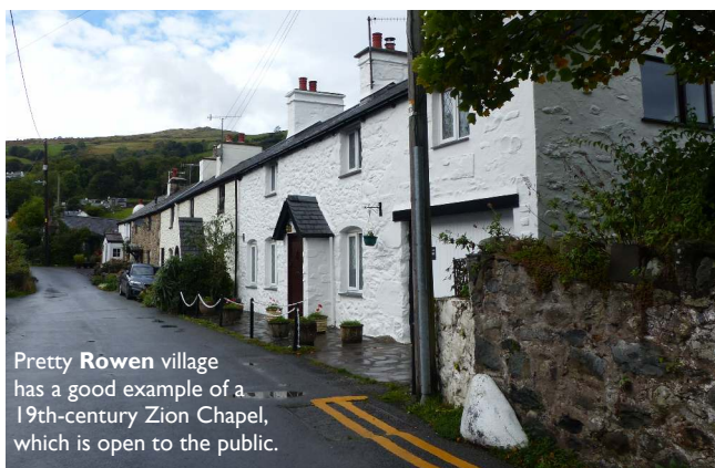
Pretty Rowen village has a good example of a 19th-century Zion Chapel, which is open to the public.