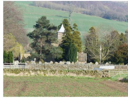
The body of St Lawrence's Church, Barlow , is 12th-century Norman, with Victorian additions in the same style. A sundial in the churchyard displays the site's latitude and longitude.