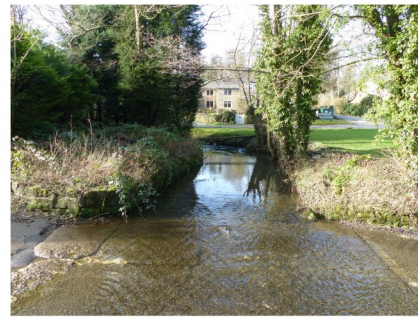
One of the two fords at Millthorpe is overlooked by pretty cottages (and avoidable using the footbridge from which this photograph was taken!). Further downstream, the Barlow Brook feeds a series of fishing ponds and flows under the Grade-II-listed Lee Bridge below the fishery.