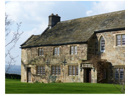
Bole Hill House is a former schoolhouse dated 1677, with a 19th-century extension to the right. It has Gothick windows throughout.