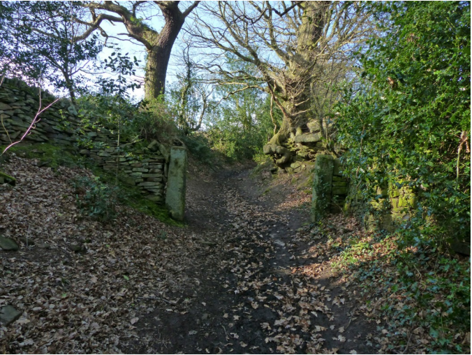
Gateland Lane, near Lee Bridge