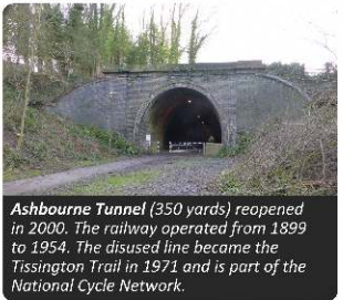
Ashbourne Tunnel (350 yards) reopened in 2000. The railway operated from 1899 to 1954. The disused line became the Tissington Trail in 1971 and is part of the National Cycle Network.

The tower of St Leonard's, Thorpe, is Norman or even possibly Saxo-Norman. The church also possesses a 'Breeches Bible', in which Adam and Eve are said to have donned breeches, rather than the traditional fig leaves.