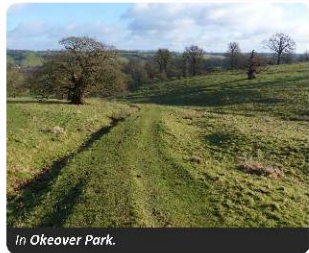
In Okeover Park.

Ham Manifold Blore Stoke (A52) Leek (A523) Ashbourne