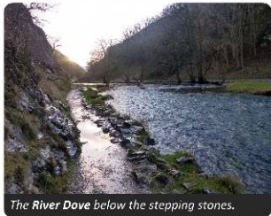
The River Dove below the stepping stones.