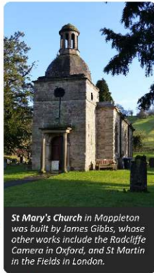
St Mary's Church in Mappleton was built by James Gibbs, whose other works include the Radcliffe Camera in Oxford, and St Martin in the Fields in London.

Coldwall Bridge is on a former turnpike road, hence its unexpectedly large dimensions.