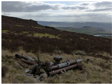
On Tintwistle Knarrs lie the poignant remains of Avro Lancaster PA411 , which crashed on a night exercise in December 1948 with the loss of all seven crew.