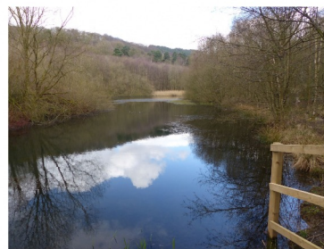
Swallow's Wood Nature Reserve surrounds the site of the disused Hollingsworth Reservoir.