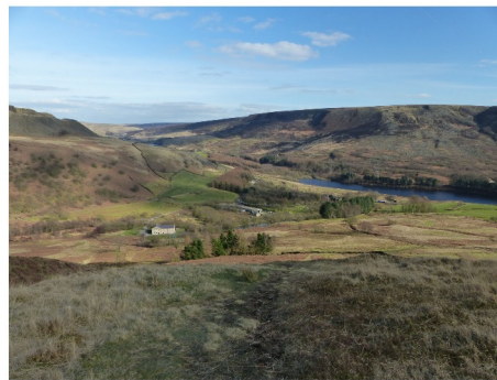
The views over Crowden-in-Longdendale and its adjoining reservoirs are spectacular. The slopes of Bleaklow , the second-highest hill in Derbyshire, provide the backdrop.