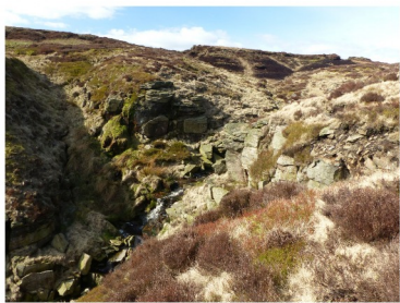
At Lad's Leap a small stream tumbles off the plateau and down a gritstone gorge. A local fell race takes its name from this landmark.