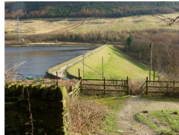
The reservoirs of the Longdendale Chain were built in the mid-19th century to provide water for Manchester. The top three reservoirs (Woodhead, Torside and Rhodeswood) are for drinking water; Valehouse and Bottoms Reservoir provide compensation water for the River Etherow.