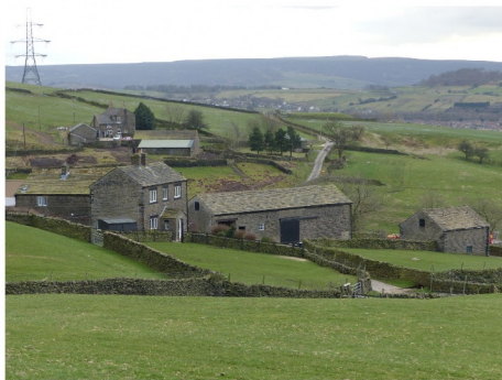
Arnfield is a pretty cluster of farm buildings overlooking the reservoir of the same name.