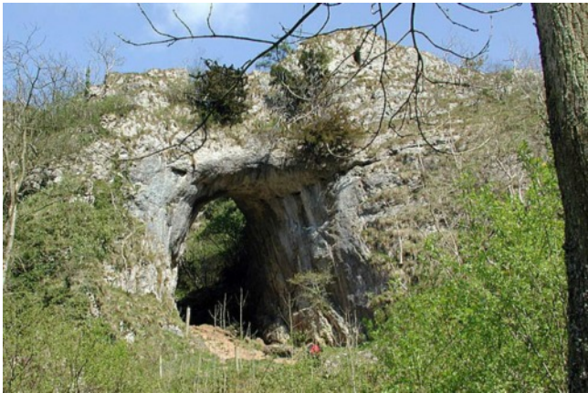
Reynard's Cave is one of the spectacular limestone landforms for which Dovedale is famous. A hoard of Roman and late Iron Age coins was found in the cave beyond the arch in 2014.