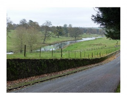
North of the village the Sherborne Brook is dammed to form an ornamental lake. In winter it attracts wildfowl such as Tufted Duck, Grey Heron and Wigeon.