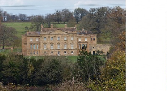
Barrington Park is a Grade-I-listed Palladian manor house built in 1737 by Charles, Lord Talbot, Lord Chancellor to George I. The house is private, but is seen well from the footpath between Little Barrington and Windrush village.