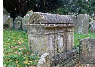
Many local churchyards contain bale tombs, a Cotswold speciality – the rounded tops represent bales of wool, a symbol of the local prosperity due to this commodity. This one is at Windrush.