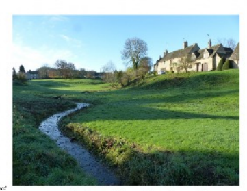
In a county famed for attractive villages, Little Barrington is surely one of the loveliest. Its village green is divided by a stream, crossed by stone footbridges.