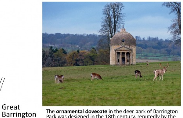
The ornamental dovecote in the deer park of Barrington Park was designed in the 18th century, reputedly by the architect and landscape gardener William Kent. It is a Grade II* listed building.