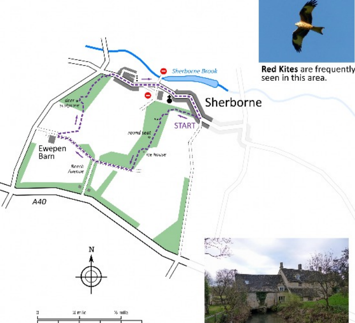
Windrush Mill, built in the mid-17th or early 18th century, is seen well from a new footbridge over the mill-race.