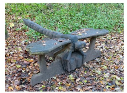
Within the grounds of Sherborne Park the National Trust has established a number of family-friendly walking routes (one of which is followed here) and installled a series of quirky sculptures.