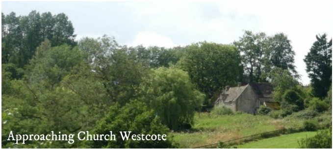
Approaching Church Westcote