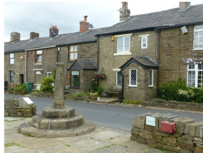
Affetside Cross , although standing beside the Roman road known as Watling Street, is most likely medieval in date, and may have been a route marker or market cross. It is a Grade II listed building.