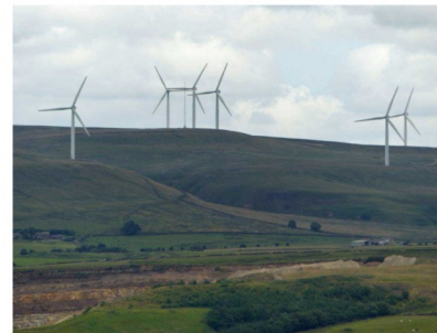
Scout Moor Wind Farm , prominent on the skyline to the east, has 26 turbines and was the largest onshore wind farm in England when it opened in 2008. To its left is the Peel Monument above Ramsbottom.