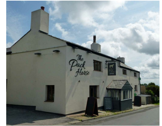
Affetside, Greater Manchester