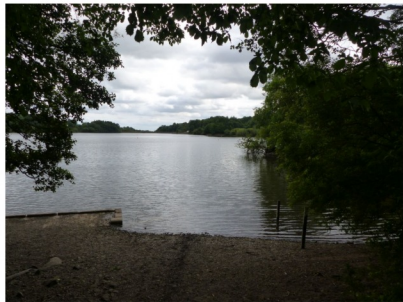
Jumbles Reservoir was opened by Queen Elizabeth II in 1971, and ensures a constant water supply for the rivers Croal and Irwell. The reservoir and surrounding woodlands are designated as a Country Park.