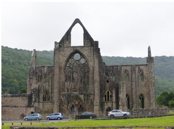
Tintern Abbey was founded in 1131, though little remains of the original building; the great church was built between 1269 and 1301. It was dissolved by Henry VIII in 1536 and for two centuries was allowed to fall into decay: at one point the ruins were occupied by local ironworkers. The 18th-century fashion for the picturesque restored its fame and it was painted by artists including JMW Turner.