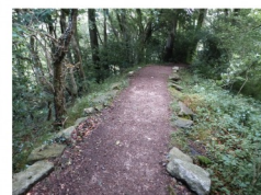
The Offa's Dyke Path follows the ancient monument for 177 miles from Chepstow to Prestatyn. Near the Devil's Pulpit it is protected by modern kerbstones.