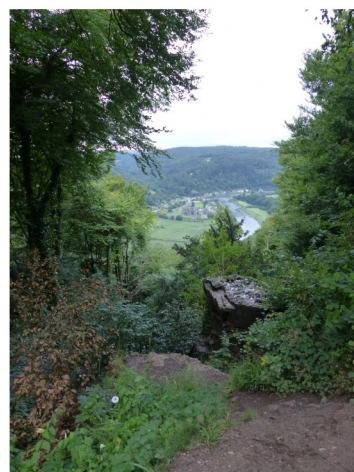
The view of Tintern Abbey and the Wye from the Devil's Pulpit is renowned. According to legend, the devil tried to lure the Abbey monks from this lofty pedestal and stamped his foot-prints into the rock in anger when unsuccessful.