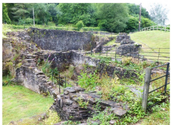
Abbey Tintern Furnace is a 17th-century ironworks built by Thomas Foley in the 1670s; another iron-master in the Angidy valley made cannons used in the American War of Independence.