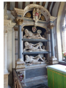
Inside the church are the famous Fettiplace monuments .