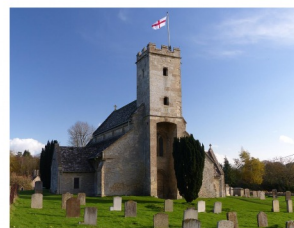
St Mary's Church, Swinbrook has much of interest, inside and out. In the churchyard you will find several bale tombs – a Cotswold speciality – and the graves of four of the famous Mitford sisters – Nancy, Diana, Unity and Pamela – plus other relatives.