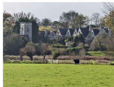
The church and manor house at Asthall form a memorable tableau when viewed across the water meadows of the River Windrush. St Nicholas' church has Norman origins.