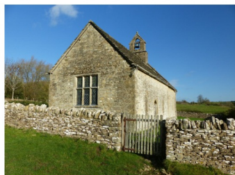
The isolated church of St Oswald, Widford is surrounded by the tell-tale humps and bumps of the deserted medieval village it once served. A Roman mosaic was discovered under the chancel floor in 1904, but is no longer on show.