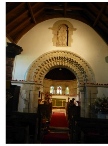
St Mary Magdalene's Church at Langridge has a Norman chancel arch and a contemporary carving of the Virgin and Child. Also surviving from the Norman church are the tower and south doorway. The manor of Langridge was sold to the Blathwayt family in 1705.