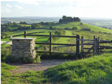
The views over Bath from Prospect Stile , with Kelston Round Hill in the foreground, are superb. Prospect Stile is on the Cotswold Way long-distance footpath, which runs for 100 miles from Chipping Campden to Bath.