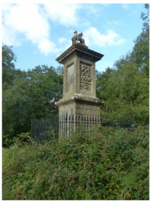
Sometimes described as the UK's first war memorial, Sir Bevill Grenville's Monument , erected in 1720, commemorates the death of the Royalist commander at the Battle of Lansdowne in 1643.