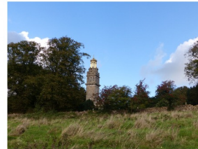
Beckford's Tower is a neoclassical folly built in 1827 and used by its owner, William Thomas Beckford, a wealthy novelist and art collector, as a retreat and library. The ground floor is available as holiday accommodation through the Landmark Trust.