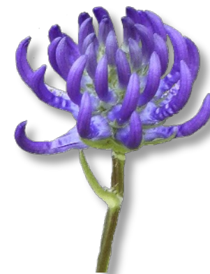
Round-headed Rampion, also known as the 'Pride of Sussex', grows above the village and on the slopes of Levin Down.