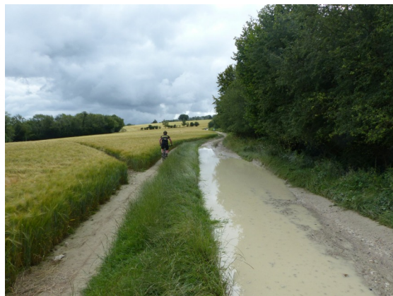
The South Downs Way runs from Winchester to Eastbourne.

Unlike most National Trails, almost all of the 100-mile route is accessible to cyclists and horse-riders.