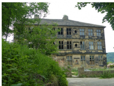
Scout Hall was built in 1681, and is a "calendar building" said to possess 12 bays, 52 doors and 365 panes of glass. It is currently under restoration.