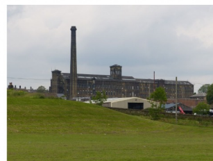
Black Dyke Mill , home of the world-famous brass band, is prominent on the skyline from the head of Shibden Dale.