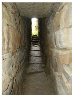
This short quarryman's tunnel is an unexpected feature of a footpath above Shibden Dale.