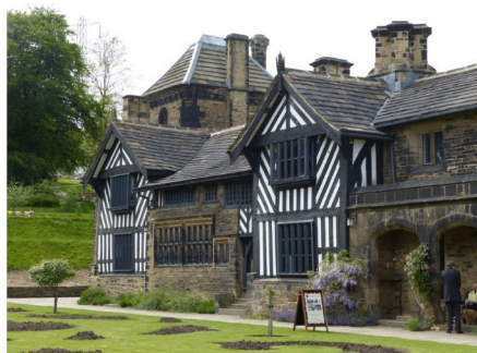
Shibden Hall dates from 1420. The grounds were extensively landscaped in 1830 on the instructions of Anne Lister, a member of the wealthy textile-manufacturing family that owned the Hall, and became a public park in 1926. The West Yorkshire Folk Museum is housed in an adjoining barn.