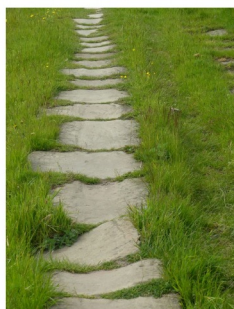
Slabbed paths are common in this area.