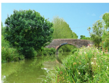
The Kennet & Avon Canal was begun in 1718. It fell into disuse but was fully reopened after decades of restoration work in 1990.