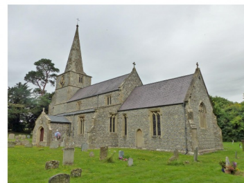
Little Bedwyn church has a 12th-century arcade with crisp Norman carvings including a comical snaggle-toothed face leering from a capital.