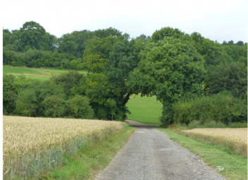
The Ramsbury Estate , owned by the boss of the H&M chain, occupies around 19,000 acres of Wiltshire, Berkshire and Hampshire countryside, centred on the village of Ramsbury in the Kennet valley north-west of Froxfield.