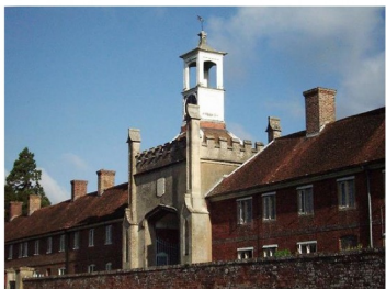
The Somerset Hospital was bequeathed by Sarah, Duchess of Somerset, in 1695. The east (right) wing is original; the west (left) wing was built in 1775. The central gatehouse and courtyard chapel were added in 1813.