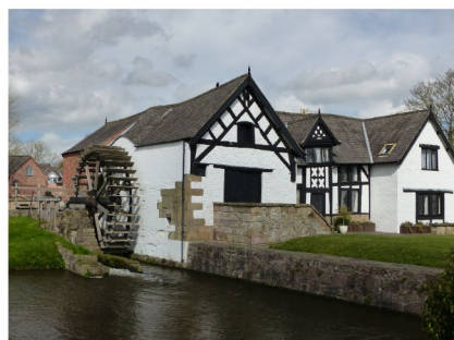
Rossett Mill is a striking timber-framed watermill dating back to 1588 and extended in 1661. Turner sketched the building in 1795. It is Grade II* listed; the listing describes it as an "exceptionally fine example of a 16th-century timber-framed undershot corn mill."