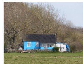
The odd collection of chalets and cabins along this stretch of the River Dee are a rare surviving example of 'plotlander' development, an unorthodox and somewhat unofficial pre-war system of settlement, usually on marginal land.