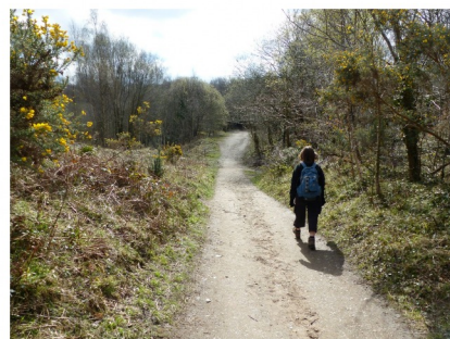
Marford Quarry is a nature reserve managed by the North Wales Wildlife Trust. The old quarry was the source of aggregate used in the building of the Mersey Tunnel. It is noted for its invertebrates and wildflowers, including the rare wild liquorice.