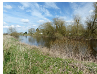
The River Dee rises in Snowdonia and runs for around 70 miles through Bala Lake and Llangollen to Chester and the Irish Sea. For much of its lower reaches (as here between Rossett and Churton, Cheshire) it forms the boundary between England and Wales.

THE GOLDEN LION Chester Road, Rossett, Wrexham LL12 0HN Tel: 01244 571020 Website: www.thegoldenlionrossett.co.uk