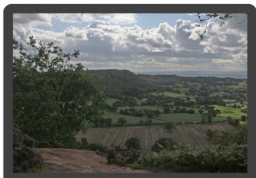
Raw Head offers stunning views over the Cheshire Plain to the Shropshire Hills and Clwydian Mountains.

All Saints Church in Harthill was built in 1609 but is now redundant. It is Grade II* listed. The mausoleum in the churchyard commemorates the Barbour family of Bolesworth Castle. Also in the churchyard are a Norman cross and two war graves dating from World War I.