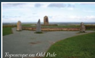
Toposcope on Old Pale