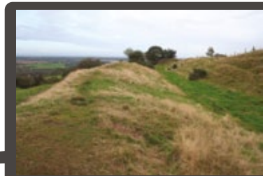
Eddisbury Hillfort is an important Iron Age hillfort. It was slighted (deliberately damaged) by the Romans, but reoccupied by Æthelflæd, daughter of Alfred the Great, in the 10th century. The eastern entrance has been excavated and rebuilt in recent years.