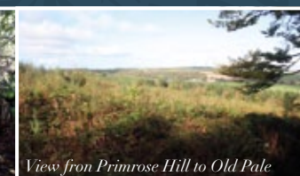
View from Primrose Hill to Old Pale