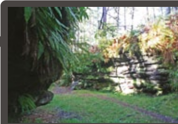
The Urchin's Kitchen is a sandstone gorge formed by glacial meltwater under high pressure.

The Sandstone Trail is a popular long-distance footpath. It runs for 34 miles from Frodsham in the north to Whitchurch (just over the Shropshire border) in the south, and passes many of the most scenic parts of the mid-Cheshire ridge. It is well signposted throughout and can be walked comfortably in a long weekend. The Pheasant Inn at Higher Burwardsley, also operated by the Nelson Hotels Group, is a convenient stopping point.