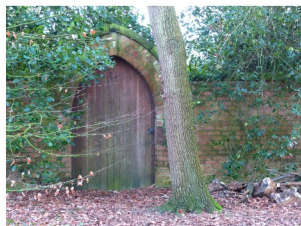
Grappenhall Heys is built on the former estate of the Parr family, founded around 1830 by an heir of a Lancashire family with banking interests in Warrington. The house and gardens were sold in 1951 to the British Transport Commission and later passed to the Warrington-Runcorn Development Corporation. The main house was demolished in the 1970s but the walled garden survives. The numerous ponds around the estate are the remains of pits from which marl – a lime-rich silty clay used as a soil conditioner and neutraliser – was dug.