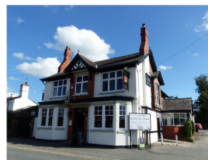
The Crown at Lymm is a sister pub of the Parr Arms; both are run by the Broad Oak Pub Company. Lymm is an attractive village on the Bridgewater Canal, centred on Lymm Cross, a Grade I listed cross erected in the mid-17th century and restored in 1897.