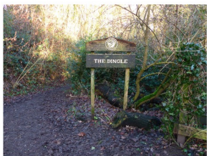
The Dingle is an attractive wooded area in the valley of the Lumb Brook. It is managed by the Woodland Trust, like several nearby woodlands (including Grappenhall Heys and Grappenhall Wood) as part of the Mersey Forest initiative. Woodland flora includes Lords and Ladies (Wild Arum), Wood Anemone and pockets of Bluebells.