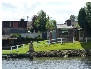
The Penny Ferry at Thelwall has been in operation since the Ship Canal opened in 1894 and is the last hand ferry on its entire length. It replaced a pontoon system that was used to ferry livestock as well as passengers. The quaint ferryman's shed and carefully maintained lawns are worth seeing even when the ferry is not operating.