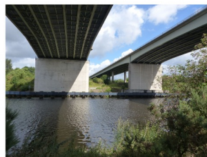
In stark contrast to their quirky and peaceful neighbour a mile to the west, the Thelwall Viaducts carry thousands of M6 motorists noisily across the Ship Canal every day. The north-bound bridge (left) was built in 1963 and was the longest motorway bridge in England at the time. The southbound bridge (right) was added in 1995.