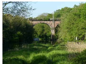
Vale Royal Viaduct carries the West Coast Main Line over the River Weaver. It was built by renowned engineer Joseph Locke in 1837 as part of the Grand Junction Railway between Crewe and Warrington.