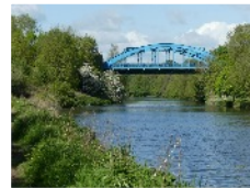
Hartford Blue Bridge was built in 1938 with Art Deco details. It is rumoured to have had a lifting section to allow tall vessels to pass below the central span, but in fact this appears to have referred to a temporary builders' platform used during construction. It replaced a single-span stone bridge.