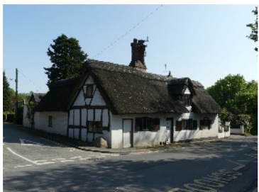
Whitegate Cottage is a Grade-II-listed thatched cottage in the pretty village of Whitegate.