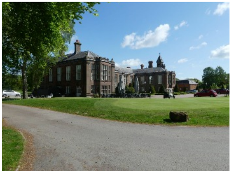
The visible parts of the house at Vale Royal Abbey , now a golf clubhouse and events venue, date from the 19th century, but inside the building are parts of the medieval cloister and monks' refectory from the monastery founded by Edward I in the late 1200s. The abbey church, long demolished, was one of the largest in England.