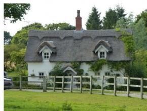
Commonsides Farmhouse was built in the mid-17th century.