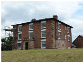
Hapsford Hall is a Grade II listed former farmhouse, built in brick in the late 18th or early 19th century.