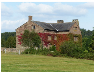
Alvanley Hall , built in red Cheshire sandstone, dates back to the 17th century and is a Grade II* listed building, the second-highest designation.