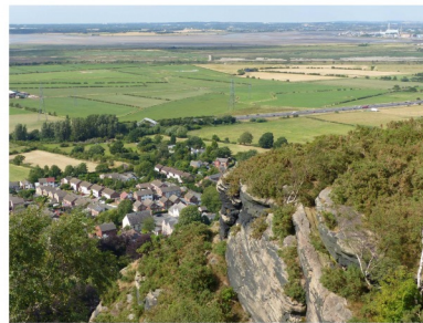
The spectacular 360° view from Helsby Hill extends to Liverpool, the Clwydian mountains of Wales, the Pennines and the Peak District. A trig point (141m) and a late Bronze Age hillfort crown the summit.