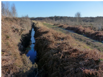
Lindow Moss is a rare habitat known as a "raised mire peat bog". It is perhaps best known for the discovery of Lindow Man, a preserved "bog body", by peat-diggers in 1984. The body, now in the British Museum, is around 2000 years old.