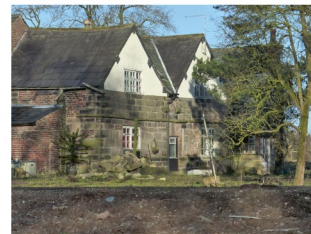
Saltersley Hall is an isolated Grade II listed 17th-century farmhouse. Pevsner described it as a "lonely but high-status ... house on a sand island in the middle of Lindow Moss".