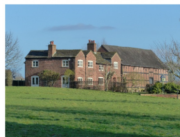
Barlow House Farm and its impressive half-timbered barn are Grade II listed buildings from the early 1600s.