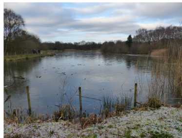
Black Lake ( Lynn ddu in Welsh, hence the name of the Common) was originally a peaty lake fed by natural springs. It is now solely rain-fed, following a drop in the water table, and is a haven for an important population of the declining Water Vole. It is the scene of ghostly goings-on in Alan Garner's classic children's fantasy adventure The Weirdstone of Brisingamen , which is mostly set on nearly Alderley Edge.