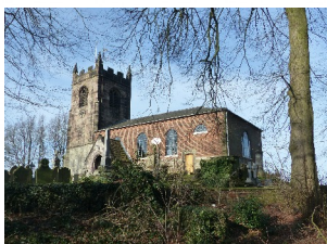
All Saints Church near Lawton Hall has a Norman doorway of the 11th or 12th century and a 16th-century tower, but the nave was rebuilt in the classical style in 1803.