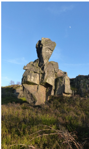
The Old Man of Mow is a 65-foot pillar of quarried gritstone, perhaps on the site of an ancient cairn.