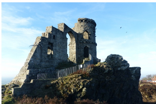
Mow Cop Castle is a folly, built as a summerhouse in 1754 by the local landowner and maintained by the National Trust. It has superb views, from Moel Famau in the northwest to The Wrekin in the south.