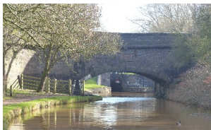
Pool Lock Aqueduct , built 1828, carries the Macclesfield Canal over the Trent & Mersey. The aqueduct and adjacent footbridge are Grade-II-listed buildings, as is the Red Bull aqueduct nearby, which carries the canal over the A50 road.