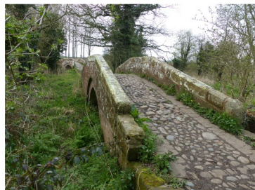
Although the Stamford Bridge Inn lies on the line of a Roman road, the so-called Roman Bridges in fact date from the late 17th or early 18th century. They lie on a packhorse route that was once the main road from London to Holyhead, and now form the centrepiece of Hockenhull Platts Nature Reserve, maintained by the Cheshire Wildlife Trust.