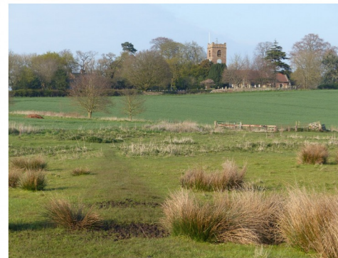
St Bartholomew's church, Great Barrow , stands on a low sandstone ridge overlooking the Gowy valley. It contains some late medieval stonework but the chancel was built in 1671 and the tower in 1744. A delightful hollow way, part of a permissive path, leads up to the church from Milton Brook.