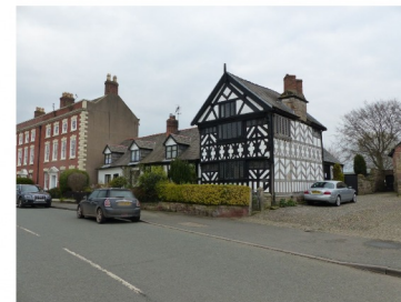
Church House in Tarvin is a former farmhouse dating from the mid- to late 1500s. The adjacent Church of St Andrew is a Grade I listed building with a Perpendicular tower and a hammerbeam roof dating from 1650. Also in the churchyard are the old grammar school, dated 1666, a hearse house and two former cottages. The Georgian buildings to the north of Church House are described by Sir Nikolaus Pevsner as "the two best houses in Tarvin" and date from 1756. A fire in the village in 1752 destroyed many of its older buildings.