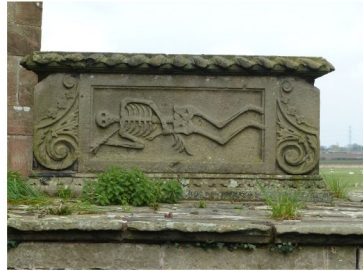
This spooky chest-tomb lies below the east window of St Peter's church at Plemstall. The church stands in near isolation among the lonely water-meadows of the River Gowy. St Plegmund's Well (dedicated to an obscure 9th-century hermit who later became Archbishop of Canterbury) is just to the west.