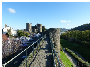
Conwy Town Walls were constructed in the 1280s and have been described as "one of the most impressive walled circuits in Europe".