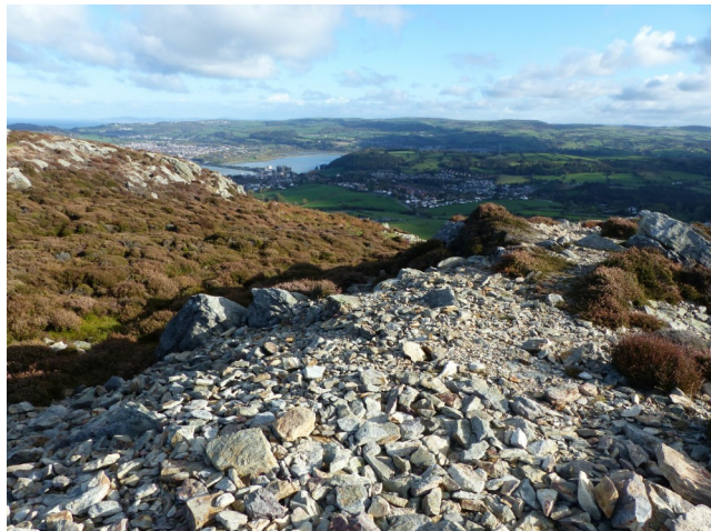
Castell Caer Seion on the summit of Conwy Mountain has been dated to the 6th century BC. It actually consists of two hillforts, the smaller, later one built inside the larger, earlier one. Within the fort are the remains of up to 50 roundhouses, though their outlines are not easily seen by the untrained eye.