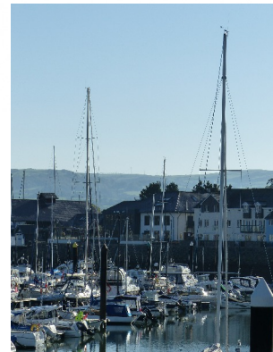
Conwy Marina shelters up to 500 boats, and has fine views across the Conwy estuary. The Mulberry Harbours used in the D Day landings were partly developed here, and the area was used as a dry dock area during the building of the Conwy Tunnel in 1986–91, at the time the UK's most expensive road project.