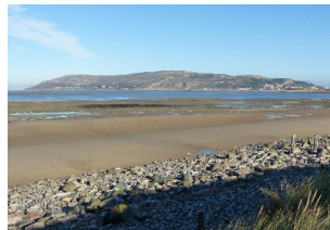
Great Orme from Morfa Conwy