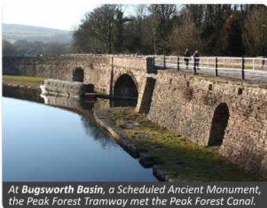
At Bugsworth Basin , a Scheduled Ancient Monument, the Peak Forest Tramway met the Peak Forest Canal.

The Roosdyche is an enigmatic landform on the hillside above Whaley Bridge. A flat-bottomed valley some 750 metres long, it was once claimed as a Roman chariot course, but a study in the 1960s concluded that it was of natural glacial origin. More recent studies have tentatively suggested Iron Age occupation.