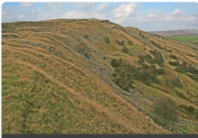
Cracken Edge was quarried for paving slabs and roofing tiles until the 1930s. Several artefacts remain, including the winding house at the top of an incline.