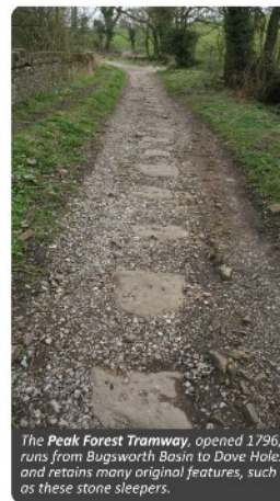
The Peak Forest Tramway , opened 1796, runs from Bugsworth Basin to Dove Holes and retains many original features, such as these stone sleepers.

The Peak Forest Canal runs for about 15 miles from its termini at Whaley Bridge and Buxworth to the Ashton Canal in Dukinfield. It also connects to the Macclesfield Canal at Marple, and thus forms part of the famous 'Cheshire Ring'. It was constructed in the 1790s under the supervision of engineer Benjamin Outram. It had become impassable by the 1960s but reopened in 1974. The warehouse building at Whaley Basin is a Grade II* listed building.