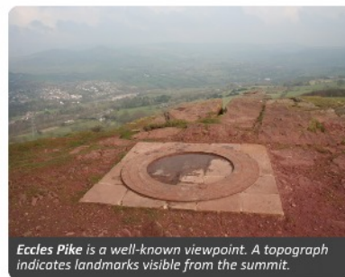
Eccles Pike is a well-known viewpoint. A topograph indicates landmarks visible from the summit.

The Roosdyche is an enigmatic landform on the hillside above Whaley Bridge. A flat-bottomed valley some 750 metres long, it was once claimed as a Roman chariot course, but a study in the 1960s concluded that it was of natural glacial origin. More recent studies have tentatively suggested Iron Age occupation.