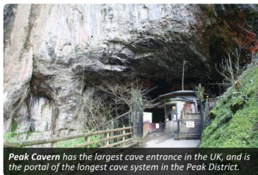
Peak Cavern has the largest cave entrance in the UK, and is the portal of the longest cave system in the Peak District.