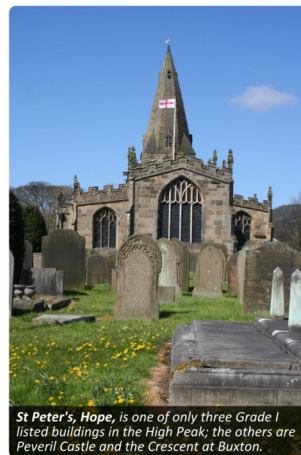
St Peter's, Hope, is one of only three Grade I listed buildings in the High Peak; the others are Peveril Castle and the Crescent at Buxton.