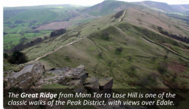
The Great Ridge from Mam Tor to Lose Hill is one of the classic walks of the Peak District, with views over Edale.