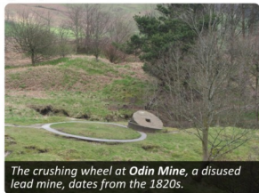
The crushing wheel at Odin Mine, a disused lead mine, dates from the 1820s.