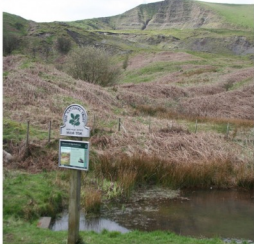
Mam Tor is topped by an Iron Age hill-fort and its eastern face is prone to landslips, which led to the closure of the main road on its flank in the 1970s.