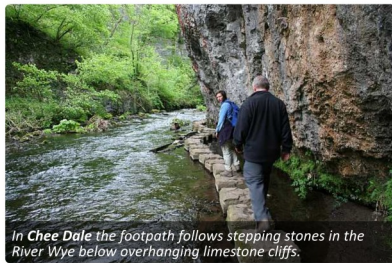
In Chee Dale the footpath follows stepping stones in the River Wye below overhanging limestone cliffs.

Two railways joined in Chee Dale, branches of the Midland Railway from New Mills and Buxton respectively. Both lines closed in the late 1960s. The line was adapted to form the Monsal Trail in 1981, the utility of which was greatly enhanced by the opening up of several tunnels in 2011.