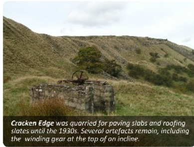
Cracken Edge was quarried for paving slabs and roofing slates until the 1930s. Several artefacts remain, including the winding gear at the top of an incline.