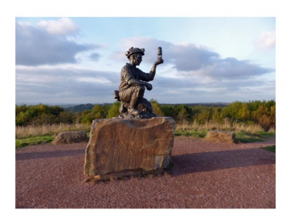
A sculpture called Testing for Gas , dedicated to the miners of the Nottinghamshire coalfields, stands on an artificial mound in Silverhil Country Park . It has been claimed as the highest point in Nottinghamshire, but amateur surveyors determined it to be a few feet lower than a point on Newtonwood Lane, near the communications mast visible a mile to the southwest.