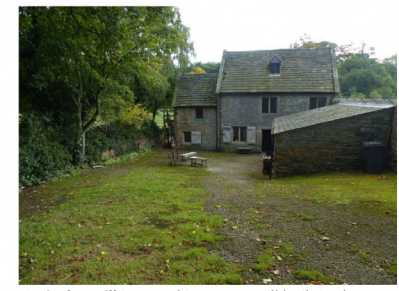
Stainsby Mill is a working watermill built in the late 18th century and powered by the waters of the River Doe Lea. It is operated by the National Trust; flour is still ground and available to buy.