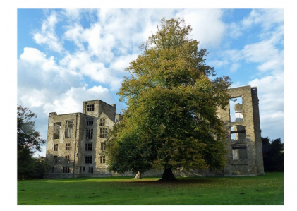
Hardwick Old Hall, built slightly before the "New" Hall, is now ruinous but retains some of its internal plasterwork. Both buildings are Grade I listed.