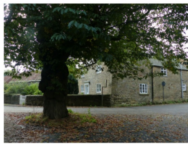
Stainsby village is an attractive hamlet centred on an ancient chestnut tree.