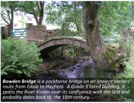
Bowden Bridge is a packhorse bridge on an ancient carriers' route from Edale to Hayfield. A Grade II listed building, it spans the River Kinder near its confluence with the Sett and probably dates back to the 18th century.

THE ROYAL HOTEL HAYFIELD • PEAK DISTRICT