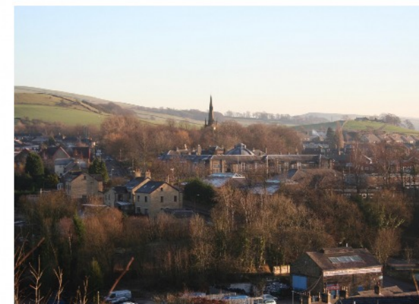
New Mills from Spring Bank