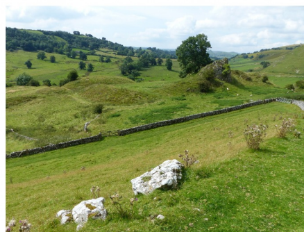
Pilsbury Castle is a Norman motte-and-bailey castle, on a site that was probably previously occupied by an earlier Iron Age fortification. It incorporates natural limestone outcrops as well as a large man-made mound, the motte, which would have been crowned by a wooden fortification. The site was abandoned by 1200 and is now a Scheduled Monument in a scenic location next to the River Dove.

Monyash probably owes its existence to a band of impervious clay that allowed natural ponds to form, rare in this limestone area (of these, the Fere Mere survives). The village is centred on its green, with a medieval cross. The church of St Leonard has Norman elements but was heavily restored by the architect William Butterfield in the late 19th century.