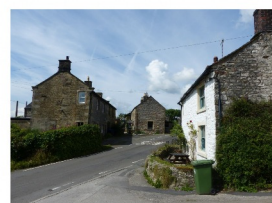
Crowdecote is a delightful cluster of cottages set above a bridge over the River Dove.