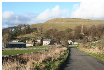
Pretty Chelmorton sits in the shadow of Chelmorton Low. St John the Baptist's is said to be the highest church with a spire above sea level in England. Bank Top Spring near the church feeds the Illy Willy Water, source of the village's water supply in bygone days.