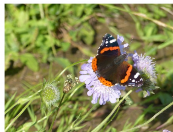
A Red Admiral butterfly on a Field Scabious flower. Flower-lined green lanes full of butterflies are a feature of the routes around Monyash and Flag during the summer months. Redstarts and Whitethroats are among the birds likely to be encountered in the track-side bushes.

Monyash probably owes its existence to a band of impervious clay that allowed natural ponds to form, rare in this limestone area (of these, the Fere Mere survives). The village is centred on its green, with a medieval cross. The church of St Leonard has Norman elements but was heavily restored by the architect William Butterfield in the late 19th century.