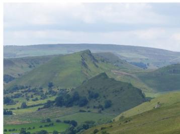
The views over the Dove valley to Parkhouse and Chrome Hills from High Wheelton are spectacular. These hills, and also the limestone knolls around which Pilsbury Castle was built, are the remains of ancient coral reefs.