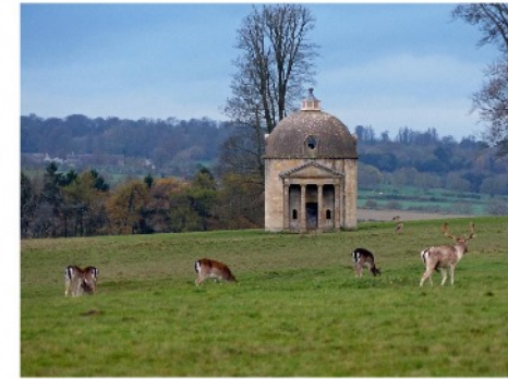
The ornamental dovecote in the deer park of Barrington Park was designed in the 18th century, reputedly by the architect and landscape gardener William Kent. It is a Grade II* listed building.