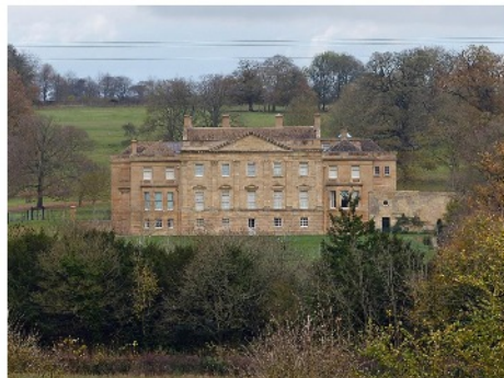
Barrington Park is a Grade-I-listed Palladian manor house built in 1737 by Charles, Lord Talbot, Lord Chancellor to George I. The house is private, but is seen well from the footpath between Little Barrington and Windrush village.