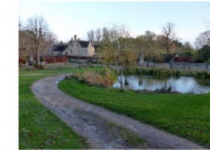
Westwell is a pretty Oxfordshire village, with an interesting church and a spring-fed village pond.