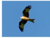
Red Kites are frequently seen in this area.