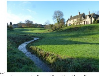
In a county famed for attractive villages, Little Barrington is surely one of the loveliest. Its village green is divided by a stream, crossed by stone footbridges.