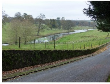
North of the village the Sherborne Brook is dammed to form an ornamental lake. In winter it attracts wildfowl such as Tufted Duck, Grey Heron and Wigeon.