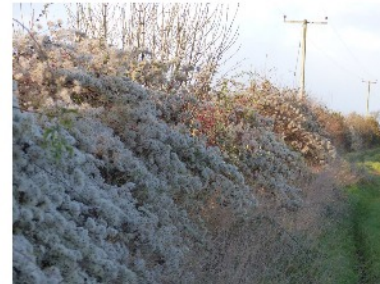
In autumn the hedgerows around Westwell are thick with the fluffy seedheads of the wild clematis ( Clematis vitalba ), commonly known as Old Man's Beard or Traveller's Joy .