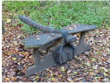
Within the grounds of Sherborne Park the National Trust has established a number of family-friendly walking routes (one of which is followed here) and installed a series of quirky sculptures.