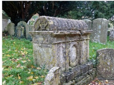
Many local churchyards contain bale tombs , a Cotswold speciality – the rounded tops represent bales of wool, a symbol of the local prosperity due to this commodity. This one is at Windrush.