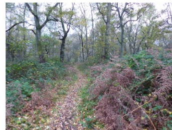
Foxholes Nature Reserve is an expanse of ancient woodland maintained by the Berks, Bucks and Oxon Wildlife Trust. It is home to the rare Bechstein's Bat and White Admiral butterfly and many kinds of fungi.