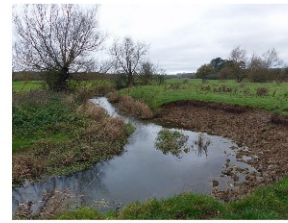
The River Evenlode rises near Moreton-in-Marsh and runs generally south-east for 40 miles before flowing into the Thames between Witney and Oxford.