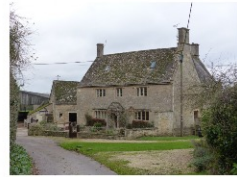
University Farm is typical of the attractive Cotswold stone buildings in Bledington and the surrounding villages.