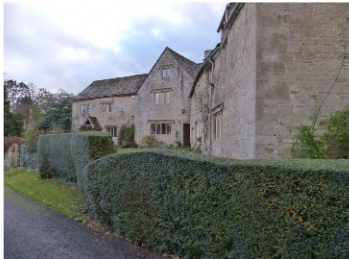
Stayt's Farm in Church Westcote was built in the late 1600s and is a Grade II listed building.