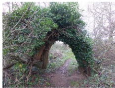
This natural willow arch spans the public footpath to the Evenlode north of Bledington village.