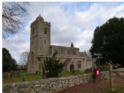
St Leonard's Church in Bledington, dating in part back to 1170, is a fine example of a Cotswold parish church. Its high clerestory windows give the interior a light and airy feel. Carvings on the exterior walls illustrate a range of medieval headgear.