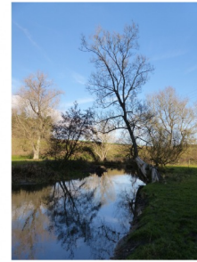
The River Coln rises at Brockhampton near Cheltenham and flows into the Thames at Lechlade.