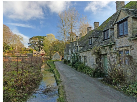
Arlington Row must be one of the most-photographed spots in the Cotswolds. It was originally a monastic wool store, and converted into weavers' cottages in the 17th century. It appears on the inside cover of the UK passport, and featured in the film Bridget Jones' Diary .