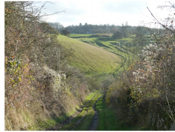
An attractive section of bridleway between Arlington and Coneygar, leading to Akeman Street , a Roman road.