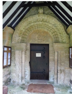
The Church of St Swithin at Quenington is famous for its two fine Norman doorways, described as "one of the very best collections of Romanesque carving in England."