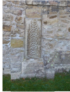
This rare Saxon gravestone is embedded in the external wall of the church at Bibury. Inside the church are replicas of two others – the originals are in the British Museum.