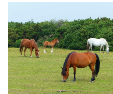
Most of the ponies you will see roaming wild in the Forest are mares, foals and geldings. The number of stallions is tightly controlled and their releases limited to spring and summer.