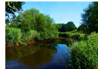
Reed Warblers and the rarer Cetti's Warbler can be heard along the River Lymington.

Parking at the Walhampton Arms is for patrons only. Dogs are welcome in the hard-floored areas.