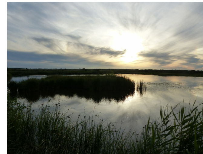
The marshes between Keyhaven and Lymington, many of them formed from the remnants of former salt pans, comprise one of the best birdwatching areas on the south coast. Key species include Avocet, Spoonbill, Marsh Harrier and Dartford Warbler. The whole area is an SSSI.