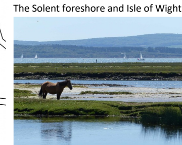
The Solent foreshore and Isle of Wight