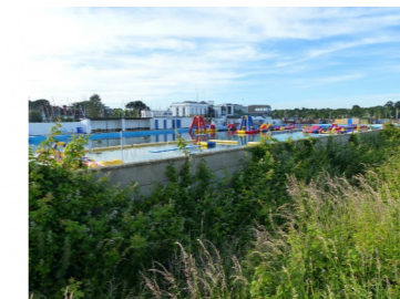
The oldest open-air lido in Britain, and also one of the largest, the Lymington Sea Water Baths are Grade II listed.

Parking at the Walhampton Arms is for patrons only. Dogs are welcome in the hard-floored areas.