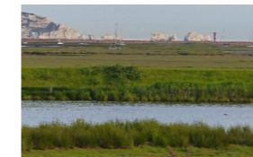
Keyhaven and Pennington Marshes offer good views of Hurst Castle, built by Henry VIII, and the north coast of the Isle of Wight, including the famous Needles rocks and lighthouse.