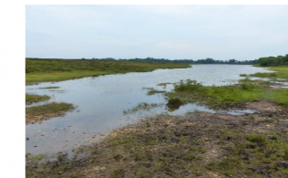
Hatchet Pond, the largest area of fresh water in the Forest, can be busy at times, but the western and northern shores are quieter.