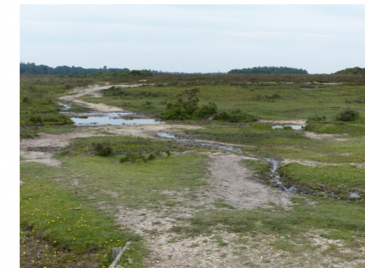
The moist areas of the forest, such as this at the head of Hatchet Pond, are home to some of the more interesting species of flora and fauna. Sundew grows here, and Redshank and Lapwing breed.