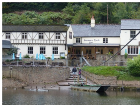
The hand ferry at Symonds Yat is operated on request by the staff of the Saracens Head. In 1800 there were 25 similar hand ferries between Ross and Chepstow.