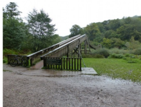
The footbridge at Biblins was built in the 1950s by the Forestry Commission, and refurbished in the 1990s. A sign advises that no more than six people should cross at once.