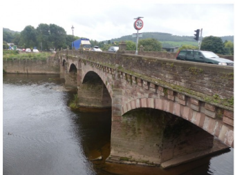
Wye Bridge, Monmouth, carries the A466 over the river. The bridge was built in about 1615, and the original narrow arches can be seen beneath the wider arches and parapet added in the 19th century.

King Arthur's Cave is also linked in legend with King Vortigern, a native British king who fought against the invading Anglo Saxons. More convincingly, the cave is known from archaeological excavations to have housed Stone Age people who left flint tools and mammoth bones behind. Material removed during the dig is still visible as a mound in front of the entrance.