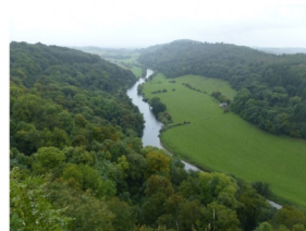
The view from Symonds Yat Rock.

King Arthur's Cave is also linked in legend with King Vortigern, a native British king who fought against the invading Anglo Saxons. More convincingly, the cave is known from archaeological excavations to have housed Stone Age people who left flint tools and mammoth bones behind. Material removed during the dig is still visible as a mound in front of the entrance.