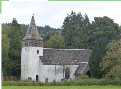
St Peter's Church, Dixon, is flooded so often that a new gallery has been built inside to store valuables out of harm's way, and they don't even bother marking the flood height with a plaque unless it's more than three feet deep! The church dates back to Norman times though it may include some Saxon material. Despite being in Wales, the church belongs to the Church of England, and as an indirect result was the first in Wales to have a woman priest celebrate Holy Communion.