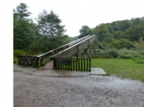
The footbridge at Biblins was built in the 1950s by the Forestry Commission, and refurbished in the 1990s. A sign advises that no more than six people should cross at once.