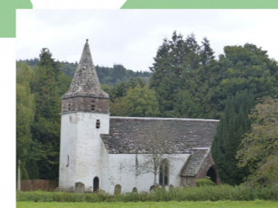
St Peter's Church, Dixon, is flooded so often that a new gallery has been built inside to store valuables out of harm's way, and they don't even bother marking the flood height with a plaque unless it's more than three feet deep! The church dates back to Norman times though it may include some Saxon material. Despite being in Wales, the church belongs to the Church of England, and as an indirect result was the first in Wales to have a woman priest celebrate Holy Communion.