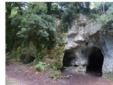
King Arthur's Cave is also linked in legend with King Vortigern, a native British king who fought against the invading Anglo Saxons. More convincingly, the cave is known from archaeological excavations to have housed Stone Age people who left flint tools and mammoth bones behind. Material removed during the dig is still visible as a mound in front of the entrance.