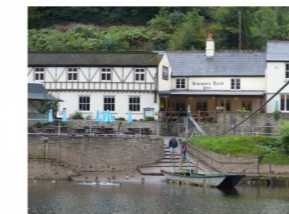
The hand ferry at Symonds Yat is operated on request by the staff of the Saracens Head. In 1800 there were 25 similar hand ferries between Ross and Chepstow.