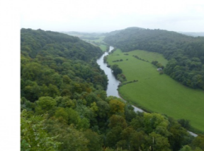
The view from Yat Rock.