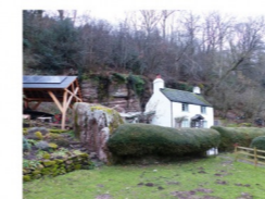
Huntsham Cottage , surrounded by rocky boulders, is a key element of the view from Yat Rock.