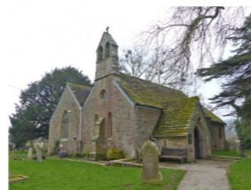
The riverside Church of St Dubricius at Whitchurch was rebuilt in the 14th century and restored in the 19th.