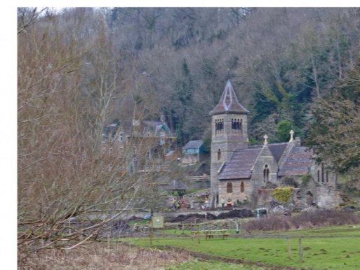
The tiny village of Welsh Bicknor , tucked between wooded hills and the River Wye, consists of little more than an isolated Victorian church, a railway tunnel and bridge, and the former rectory, now a Youth Hostel.