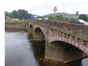
Wye Bridge, Monmouth, carries the A466 over the river. The bridge was built in about 1615, and the original narrow arches can be seen beneath the wider arches and parapet added in the 19th century.