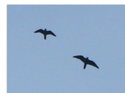
Peregrine Falcons nest on the cliffs east of Yat Rock, but can be seen year round.