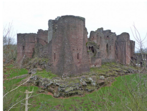
Goodrich Castle has been described as “one of the best examples of English military architecture”. The oldest part is the keep, dating from the mid-11th century; the concentric outer fortifications were added in the late 13th century. The cylindrical towers with right-angled projections, designed to be difficult to undermine during a siege, are typical of castles in the Welsh Marches.

1 From the front door of the pub, facing the river, turn right. 2 Turn off the road and walk through the car park and campsite on your left to the far corner, where a gate gives access to a riverside meadow.