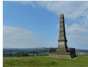
Hyde War Memorial was erected in 1921 to commemorate the sacrifice of 710 local men in World War I. It forms the centrepiece of Werneth Low Country Park and offers wide views over Manchester and beyond.

THE JOSHUA BRADLEY Stockport Road, Gee Cross, Stockport SK14 5EZ Tel: 0161 406 6776