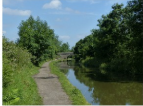
The Peak Forest Canal opened in 1796 and runs for 15 miles from Ashton-under-Lyne to Whaley Bridge in Derbyshire.