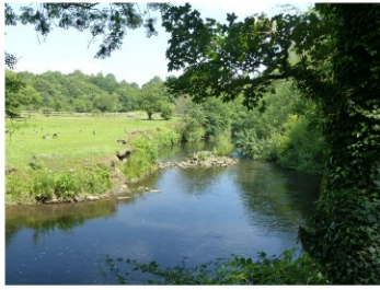
The River Tame rises in the Pennines northeast of Manchester and joins the Goyt in Stockport to form the River Mersey.