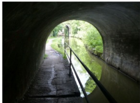
The 176-yard Woodley Tunnel is followed by the canal towpath.