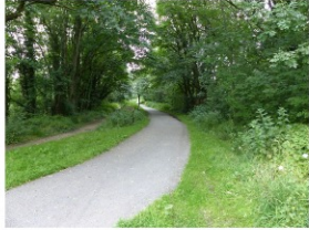
The disused railway between Apethorn and Godley is followed by the Trans-Pennine Trail and part of National Cycle Network route 62.