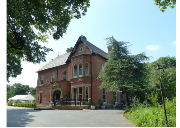
Gee Cross, Greater Manchester