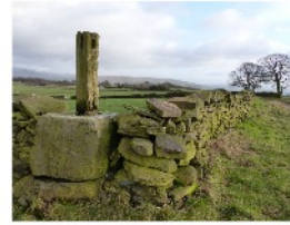
Hidden in a drystone wall at the junction of Primrose Lane and Black Lane is this medieval cross base, a Grade II listed building.