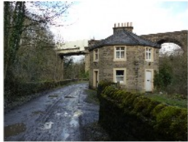
Floodgates Cottage (1801) was formerly the sluice keeper's cottage for Mellor Mill, and possibly also a tollhouse. Behind is the Goyt Viaduct, built 1865.