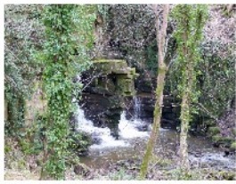
This impressive little waterfall lurks unsuspected in the valley below Mill Brow.