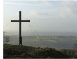
The cross on Cobden Edge, over 1000 feet above sea level, boasts fine views and was erected by Churches Together in Marple and District.