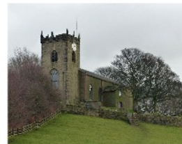
The church of St Thomas the Apostle has a rare Anglo-Saxon font within, and an eccentric gravestone mounted on the tower wall, some of which is written in a masonic cipher.