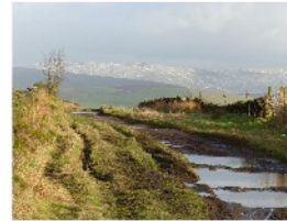
Black Lane has good views eastwards to Kinder Scout and Bleaklow, the two highest hills in Derbyshire and the Peak District.