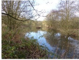
Roman Lakes began life as mill ponds for Mellor Mill (demolished after a fire in 1892), but are now a haven for wildlife and recreation.