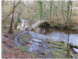
The so-called Roman Bridge is actually an 18th-century packhorse bridge over a rocky narrows on the River Goyt.